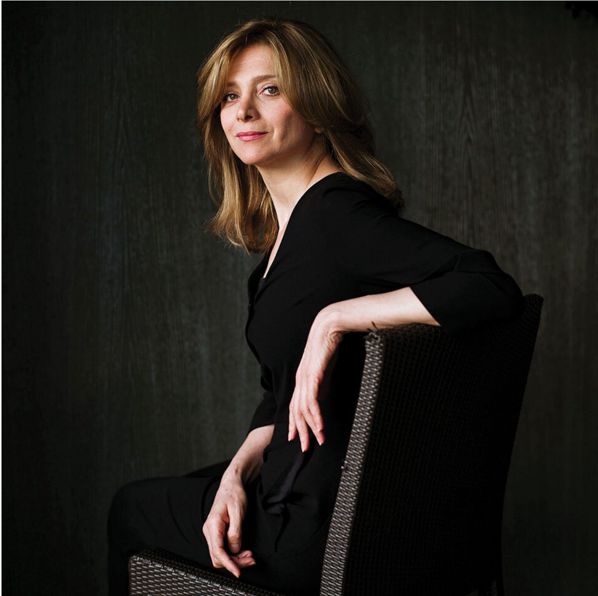
Syrian author-activist Samar Yazbek