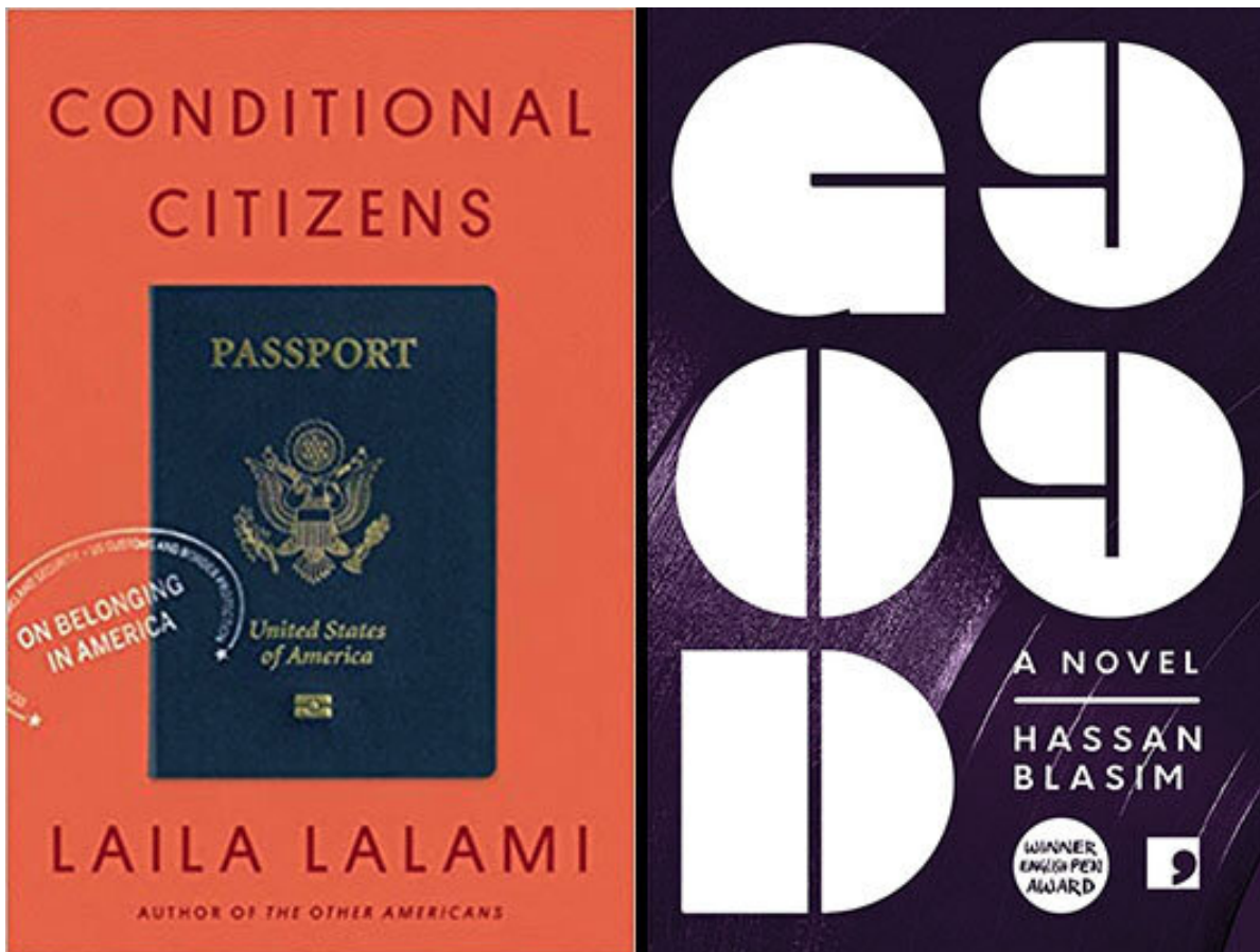
TMR BookGroup January and February 2021 selections

Thanks for reading, sharing and supporting TMR .